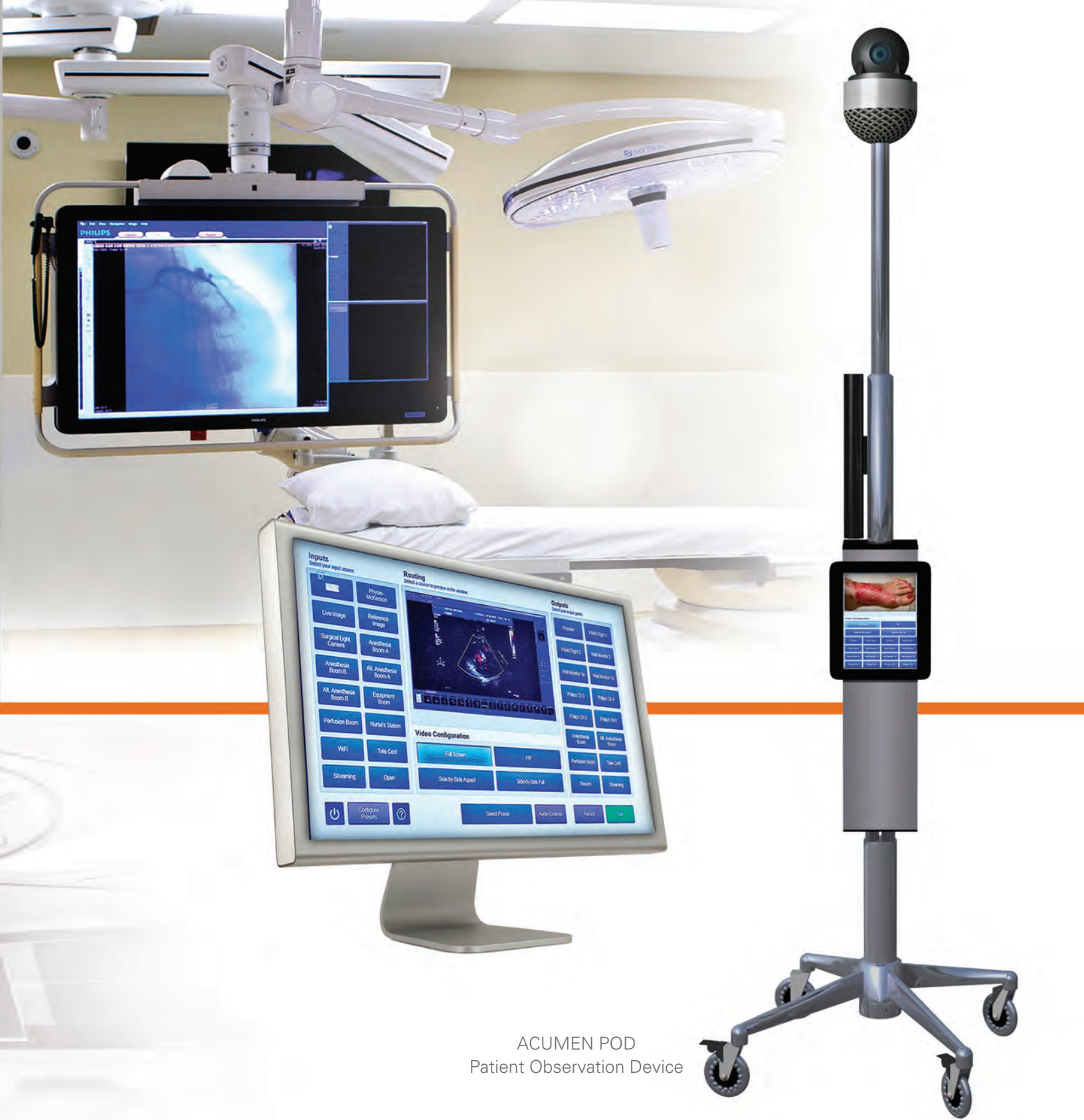
ACUMEN POD Patient Observation Device